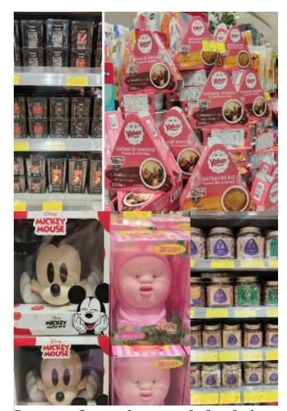
Image of popular snack foods in a Chinese supermarket.

The snack food market in China is fragmented, with the top market share (Mars Inc.) representing only 4 percent of the total market. The market fragmentation may represent an opportunity for new companies.